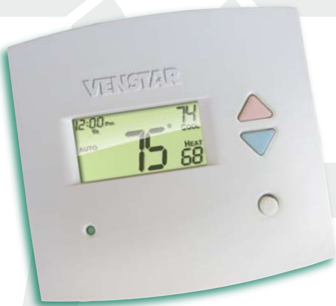
4.8" w x 4.3" h x 1.1" d